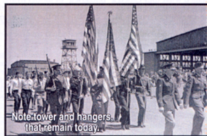
First page of an article of the Madras Airport in the Agate.

When the Air Base was de-activated, in Fall 1945, many of its auxiliary buildings were taken over by the newly-arrived North Unit Irrigation District, and others were sold and moved elsewhere, or demolished for lumber. The big recreation hall/theater on base remained in civilian use until the 1960s (it was popular with square-dancing groups), as did the Base control tower, which was used by volunteers of the Ground Observer Corps for searching the skies for Russian bombers and UFOs. But the two main hangars, each spacious enough to hold a B-17, are still in service, and have been carefully maintained over the years. They stand as reminders of the Airport's military heyday, over sixty years ago.