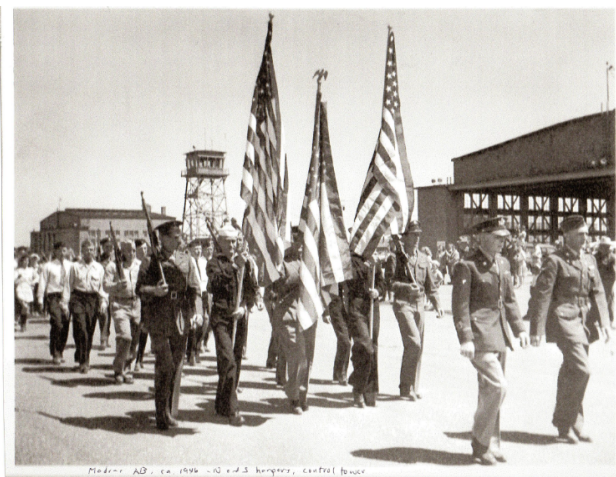
Above is a photo from a celebration in 1946. In the background is what we now know as the "North Hangar" and "South Hangar". The control tower once stood just north of where the airport office.