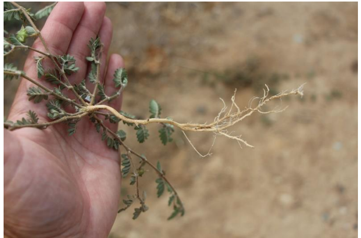
Figure 5. Puncturevine root structure.