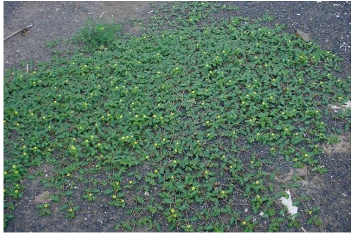
Figure 1. Mature, flowering puncturevine plant.

Stems are green to reddish or brownish, pubescent, radiate from a central axis, and may extend ten feet. Although normally prostrate, puncturevine may grow almost upright in dense crop stands. Cotyledon leaves are elliptical shaped and have a main midrib. The compound leaves are opposite and are divided into five to eight pairs of pubescent leaflets, each about 1/4 to 1/2 inch long and oval in shape (Figure 3). Yellow flowers are 1/3 to 1/2 inch wide with five petals borne in the leaf axils. Fruits consist of five wedge shaped segments or burs, each with two short