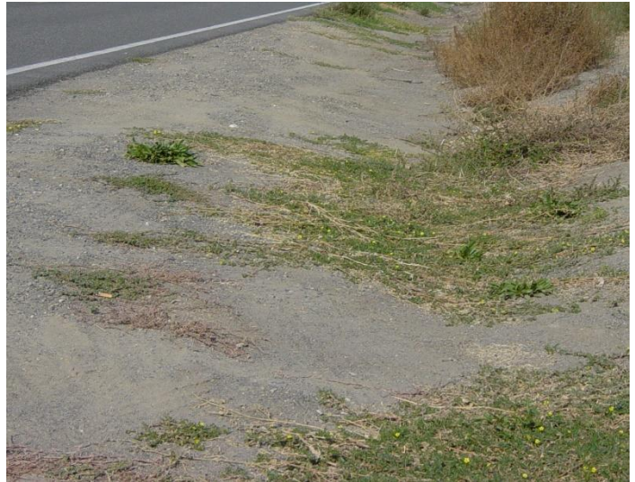
Figure 4. Roadside infestation of puncturevine.

Puncturevine reproduces from seeds formed in woody, spiny fruits with five segments that split when mature (Figure 6). Each segment, or bur, contains one to four seeds separated by the same woody tissue found in the outer walls of the fruit. The seed nearest the pointed end of the bur is the largest and usually germinates first. The other seeds germinate in order of their position in the bur when conditions are conducive. Puncturevine does not readily emerge from soil depths greater than two inches.