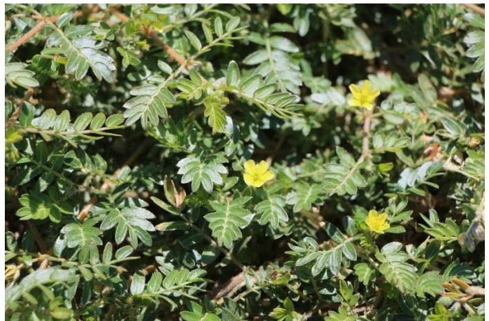
Figure 3. Puncturevine leaves and leaflets.

spines 1/5 to 1/3 inch long and numerous smaller prickles.