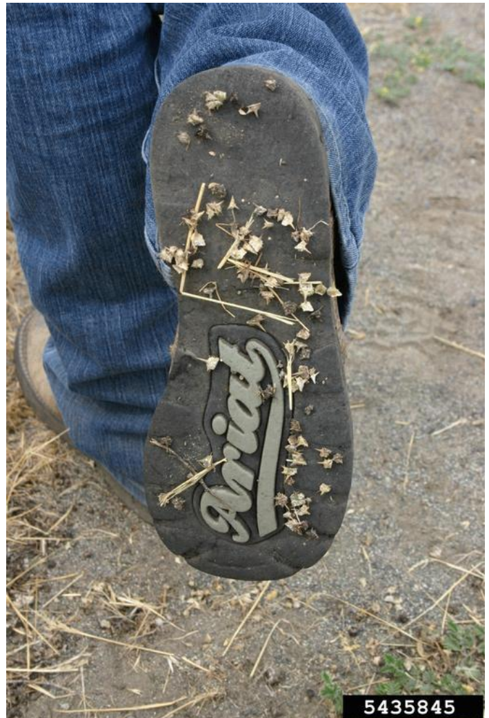
Figure 7. Puncturevine seed(s) attached to shoes.

Even though puncturevine can form large infestations, sometimes rather quickly, this plant can be effectively managed using a number of different control tactics (Table 1). To better understand how different methods and tools can be used in an Integrated Vegetation Management plan, WSU created a new video on integrated weed management . While the video