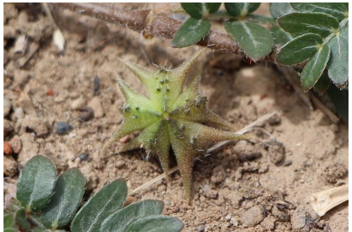
Figure 2. Puncturevine fruit.