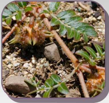
Puncture Vine (aka "goat heads")