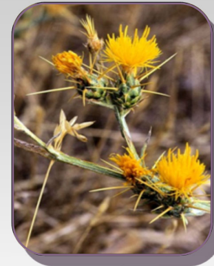
Yellow Star Thistle