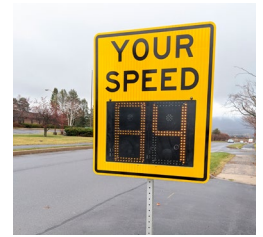
Shield 12 and Shield 15 are available with optional yellow or white wrap.